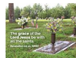
The grace of the Lord Jesus be with all the saints. Revelation 22:20, 10:1

12:00 Noon -Ascension of Our Lord, Donaldsonville